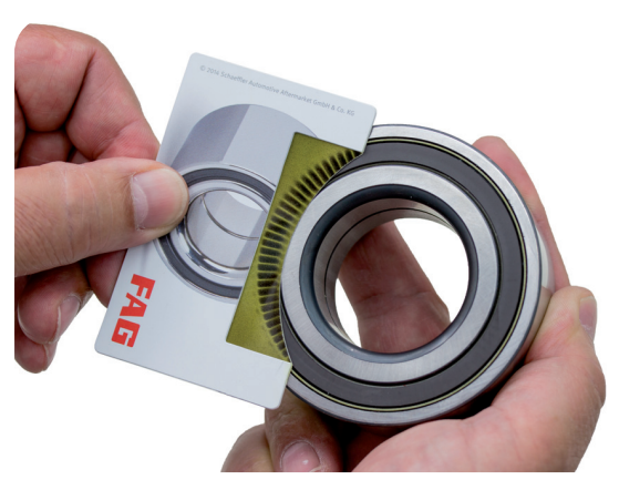
Fig. 1: The encoder card can be used to determine the installation side of a multipole encoder. With passive encoders, this does not work.

With active speed recording systems, this can be checked easily and rapidly with an encoder card (Fig. 1).