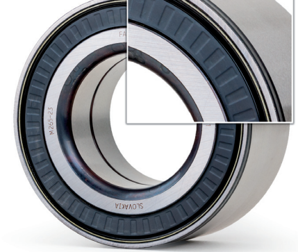
Fig. 2: The segments are located in the seal.

The wheel bearings of the wheel bearing kits listed above, on the other hand, use passive angular transducers, also known as increment rings. These encoders cannot be checked with the encoder card. The relevant segments can be recognized by the recesses in the seal (Fig. 2). This side must also be installed facing inward, i.e. toward the sensor.