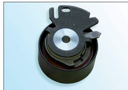
Fig. 2: OES-Type

This tensioning pulley is also supplied by LuK AS in the spare parts market.