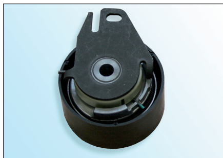
Fig. 1: OE-Type

Both tensioning pulley types are approved by the vehicle manufacturer.