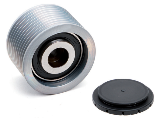
Fig. 1: Renault and Volvo deflection pulley

For current listing refer to catalogue media