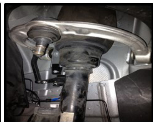
FIGURE 2 FIGURE 3

6. CUT THE CABLE TIE SECURING THE WIRE HARNESS MOUNT, THEN REMOVE THE WIRE HARNESS MOUNT FROM SHOCK. (FIGURE 4)