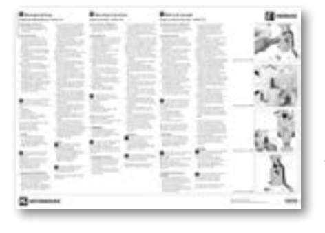
Only the pumping unit in the pumping module is replaced.

The easy replacement is described in detail in the assembly instructions (enclosed with the pump).