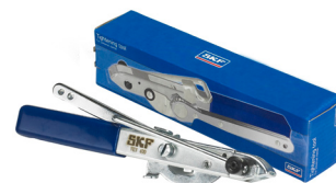
Utahovač pásek: VKN 400

Pro profesionální opravu při utahování svorek doporučujeme použít nástroj SKF VKN 400. Nesprávné utažení svorek může způsobit předčasné selhání kloubu!