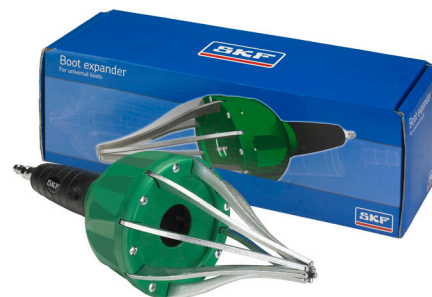
Roztahovák manžet: VKN 402

VKJP 01018 vyrobena z pružného pryže zaručuje rychlou a snadnou montáž pomocí vzduchového roztahováku VKN 402 bez nutnosti demontáže kloubu z hřídele.