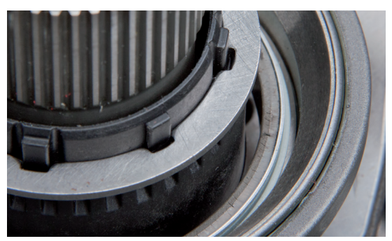
Fig. 1: Shim K2

The table (Fig. 3) compares the previous and new shim sets as well as how they are combined to form the various gauge dimensions.