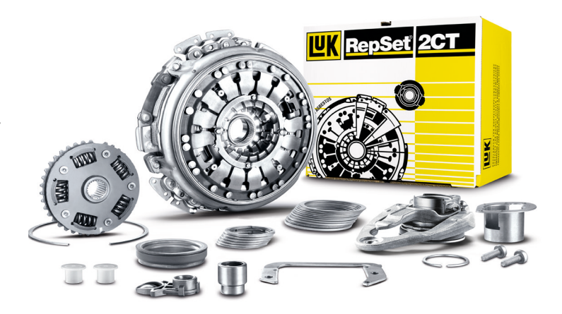
Fig. 2: LuK RepSet 2CT